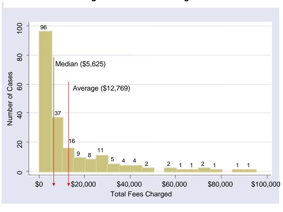
Figure 4. Total fees charged

To determine whether there was a relationship between the fees charged by the referee and either the statutory basis or the purpose of the reference, we compared the fees charged by referees appointed under section 638 and under section 639 and by referees appointed for discovery purposes and for settlement purposes. No statistically significant difference was found in the fees charged by referees appointed under section 638 or section 639. In other words, the data did not demonstrate a relationship between the fees charged by the referee and the statutory basis for the reference.