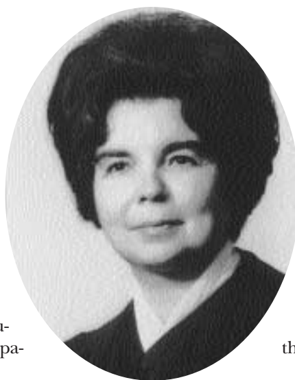
On March 14, 2002, Chief Justice Kay McFarland of the Kansas Supreme Court ordered an across-the-board increase in court fees in the state.

As the very example of the birth and growth of Parliament indicates, however, control over the treasury is a powerful political weapon that can be used against other government institutions. In controlling the purse strings, the legislature can reward or punish members of the executive and judicial branches, depending on how they