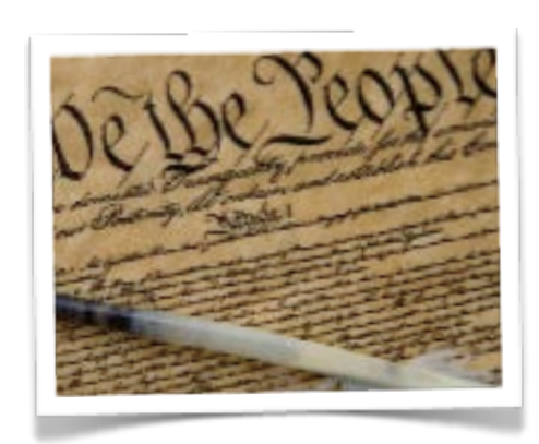
Evolving Principles Museum

At the start of the year, we said we'd be determining an answer to the question, What in American history has challenged and expanded the principles upon which the nation was founded?