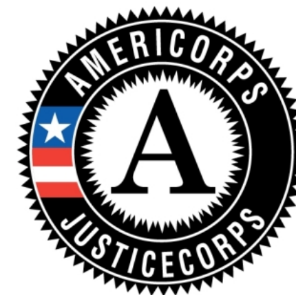
California JusticeCorps Sites