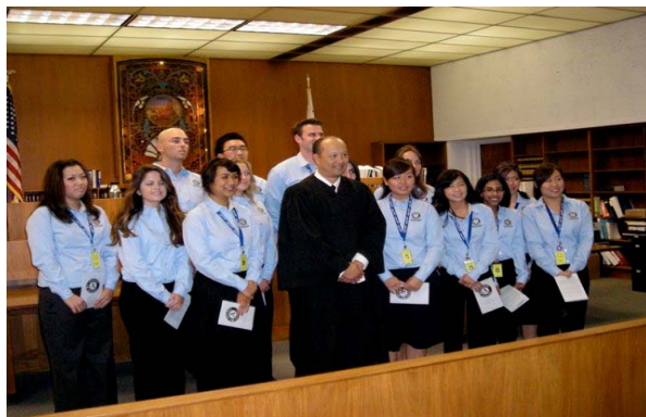
San Diego JusticeCorps members sworn into service by Judge So at the Superior Court in September 2007