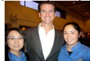
Bay Area JusticeCorps members and San Francisco Mayor Gavin Newsome