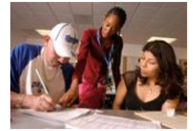
Los Angeles and Bay Area JusticeCorps members providing legal assistance