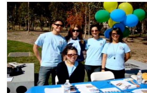
San Diego JusticeCorps members recruiting new members at UC San Diego

http://www.courtinfo.ca.gov/programs/ www.calegaladvocates.org/justicecorps/library/