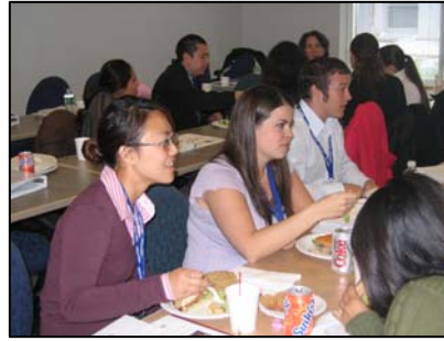
2006 Bay Area JusticeCorps members attending their two-day orientation