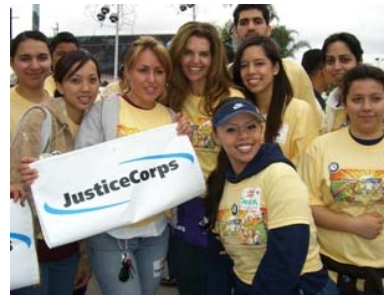
Los Angeles JusticeCorps members with Maria Schriver at a Cesar Chavez Service Day event in 2007