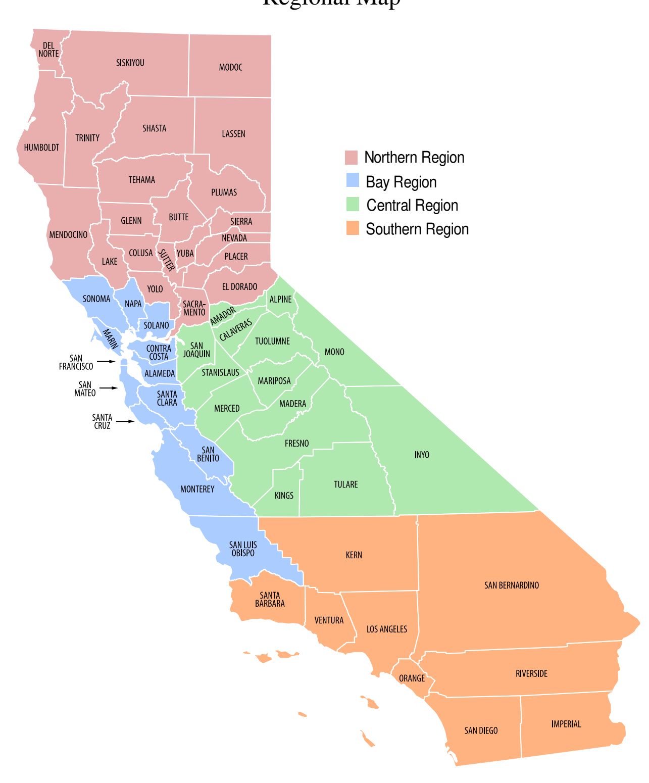
EXHIBIT 1 REGIONAL MAP AND JBE'S LISTING Regional Map