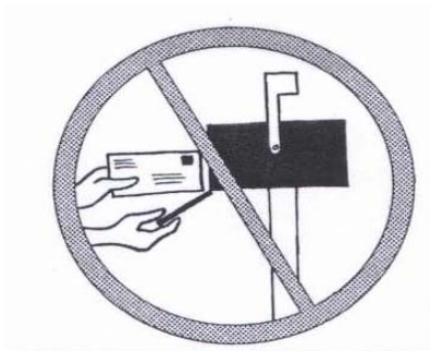
Don't serve it by mail!

(If a law enforcement agency or the process server uses a different proof-of-service form, make sure it lists the forms served.)