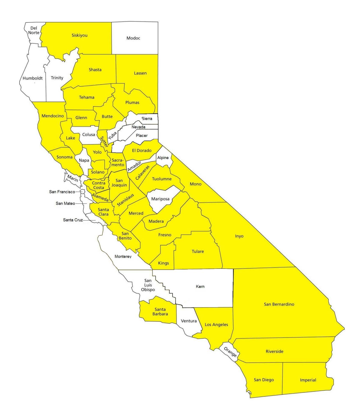
Figure 2: 36 Superior Courts Benefiting from State-Funded Trial Court Projects