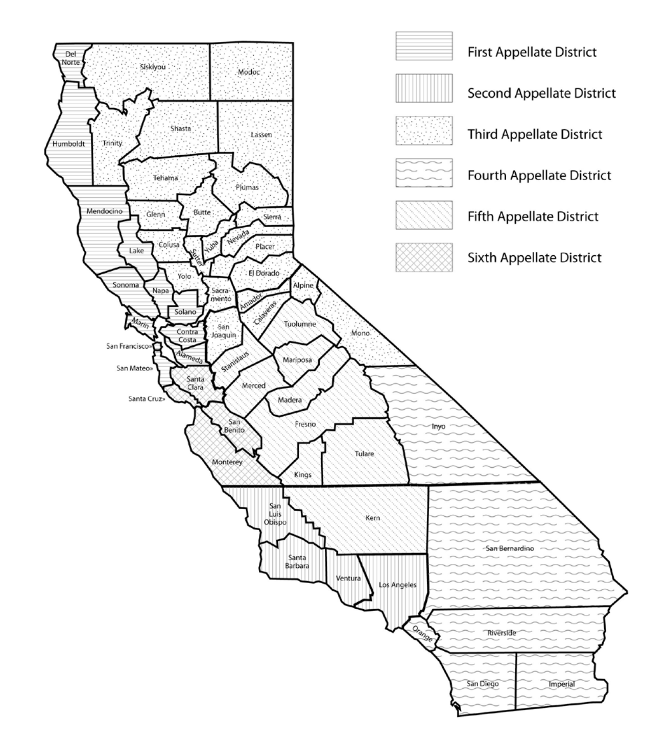
Figure 1 presents a map showing the geographical jurisdiction of each of the six appellate court districts and each of the 58 superior courts.