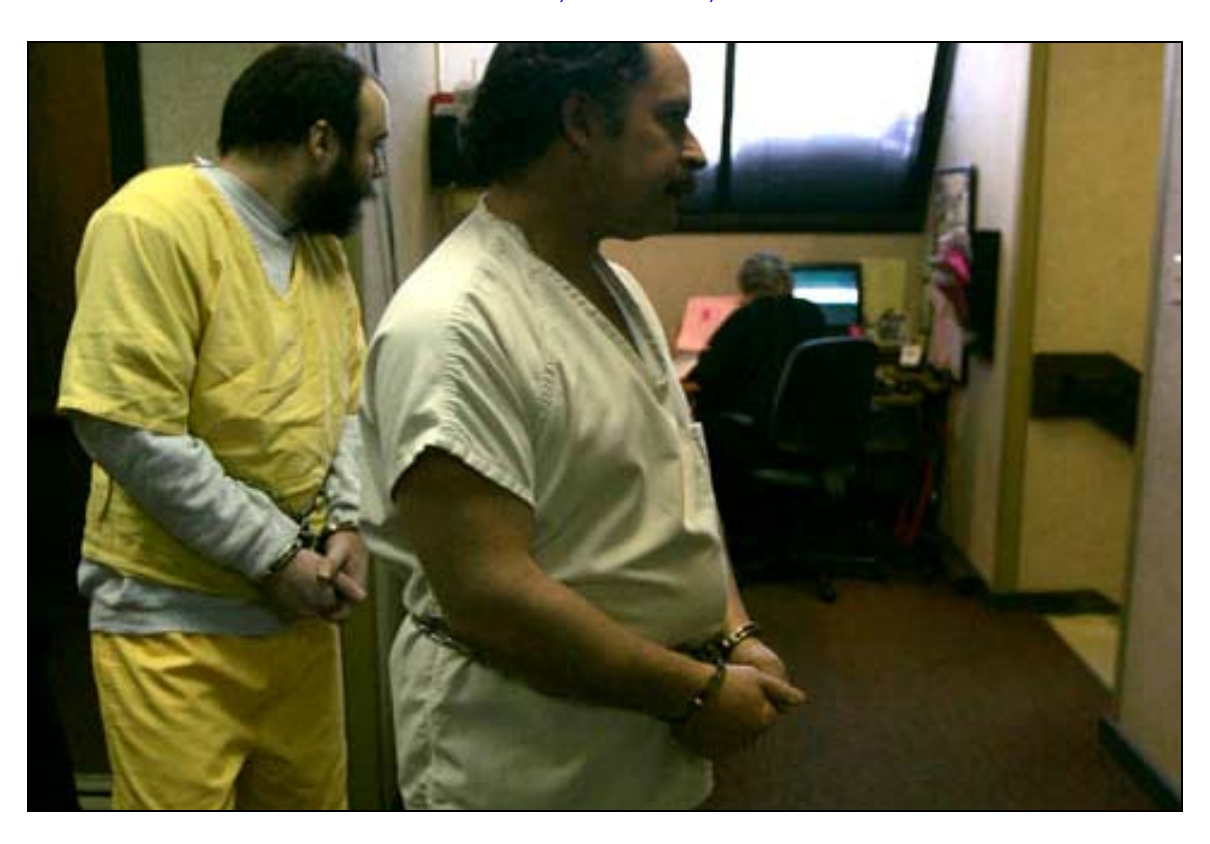
EL DORADO COUNTY COURTHOUSE