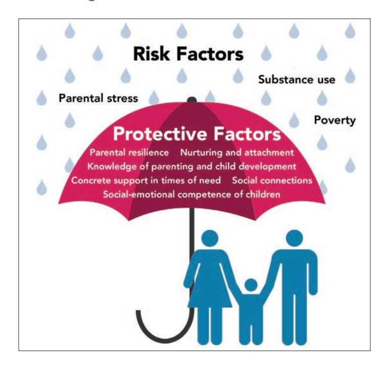
Figure 2. Risk and Protective Factors

For more information, visit Information Gateway's Preventing Child Abuse & Neglect (https://www.childwelfare.gov/topics/preventing/) and Responding to Child Abuse & Neglect (https://www.childwelfare.gov/topics/responding/) web sections.