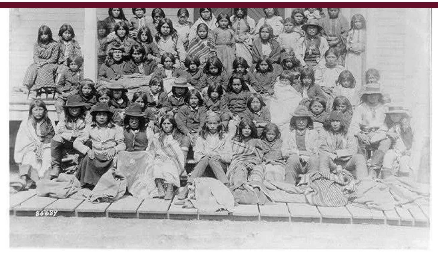
Photo of Ciricahua Apaches at Carlisle Indian School.

OPINION: HAALAND V. BRACKEEN: THE MOST IMPORTANT CASE YOU HAVEN'T HEARD ABOUT SHARE ™ TWEET