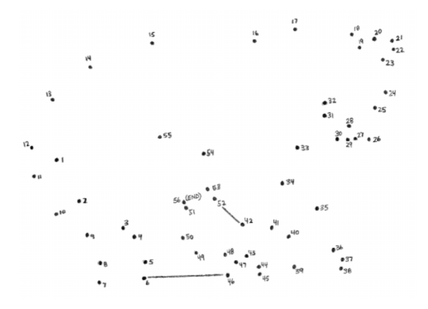
Connect the dots to draw the animal on the California state flag.

If you're afraid to answer questions in the courtroom, be sure to tell your lawyer, if you have one, or the judge. They will do everything they can to make you feel more comfortable. They may let you answer questions in the judge's office or have your CASA sit with you in court.