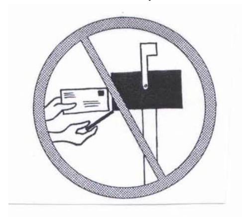
Don't serve it by mail!