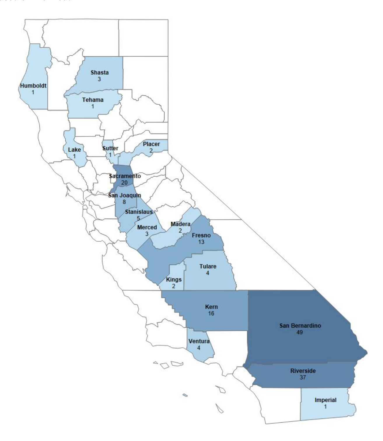
Appendix B. 2019 Judgeship Needs Map: Number of Judges Needed in California Courts Based on Workload