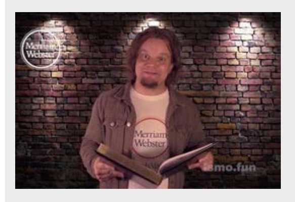
Some Odd Words with ISMO: "People Tipping"

Comedian ISMO on what separates a boot from a trunk