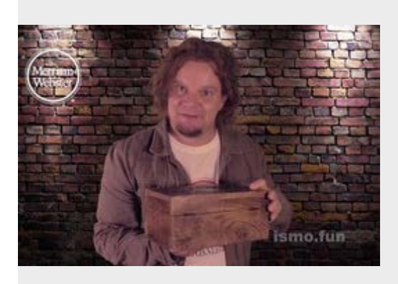
Some Odd Words with ISMO: "Junk in the Trunk"

Comedian ISMO on what separates a boot from a trunk