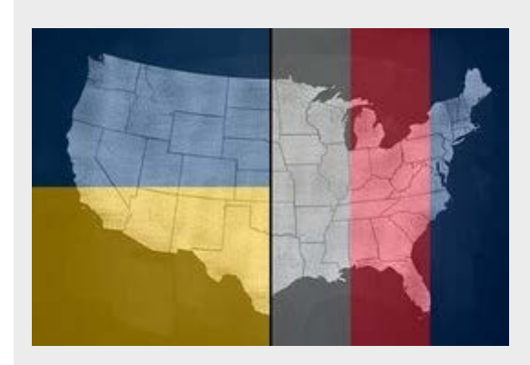
New England vs. Los Angeles: A Battle of Words | Boston vs. LA