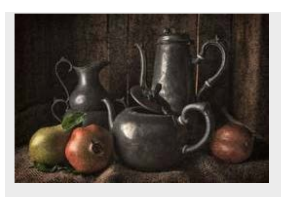
What Is the Plural of 'Still Life'?