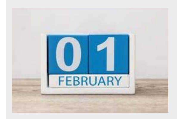
The Good, The Bad, & The Semantically Imprecise - 2/1/19